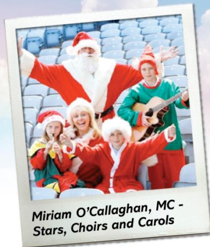
Miriam O'Callaghan, MC - Stars, Choirs and Carols