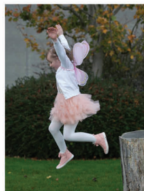
Lucy Kennedy with Miriam O'Callaghan